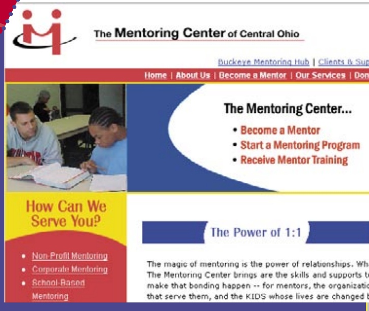
The home page of the new Mentoring Center web site

After much planning and preparations, the Mentoring Center has officially launched its new web site at www.mentoringcenterco.org . Some of the exciting aspects of the web site include: