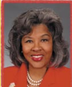
Joyce Beatty Keynote Speaker

Central Ohio mentoring programs enjoying free background checks and training from the Mentoring Center